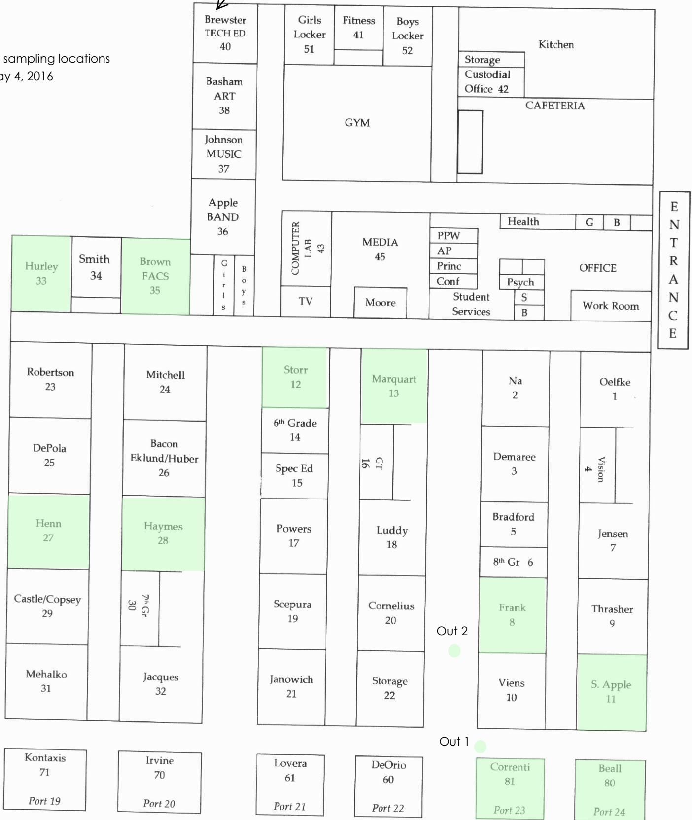
Glenwood Middle School Floor Plan

Spore sampling locations for May 4, 2016