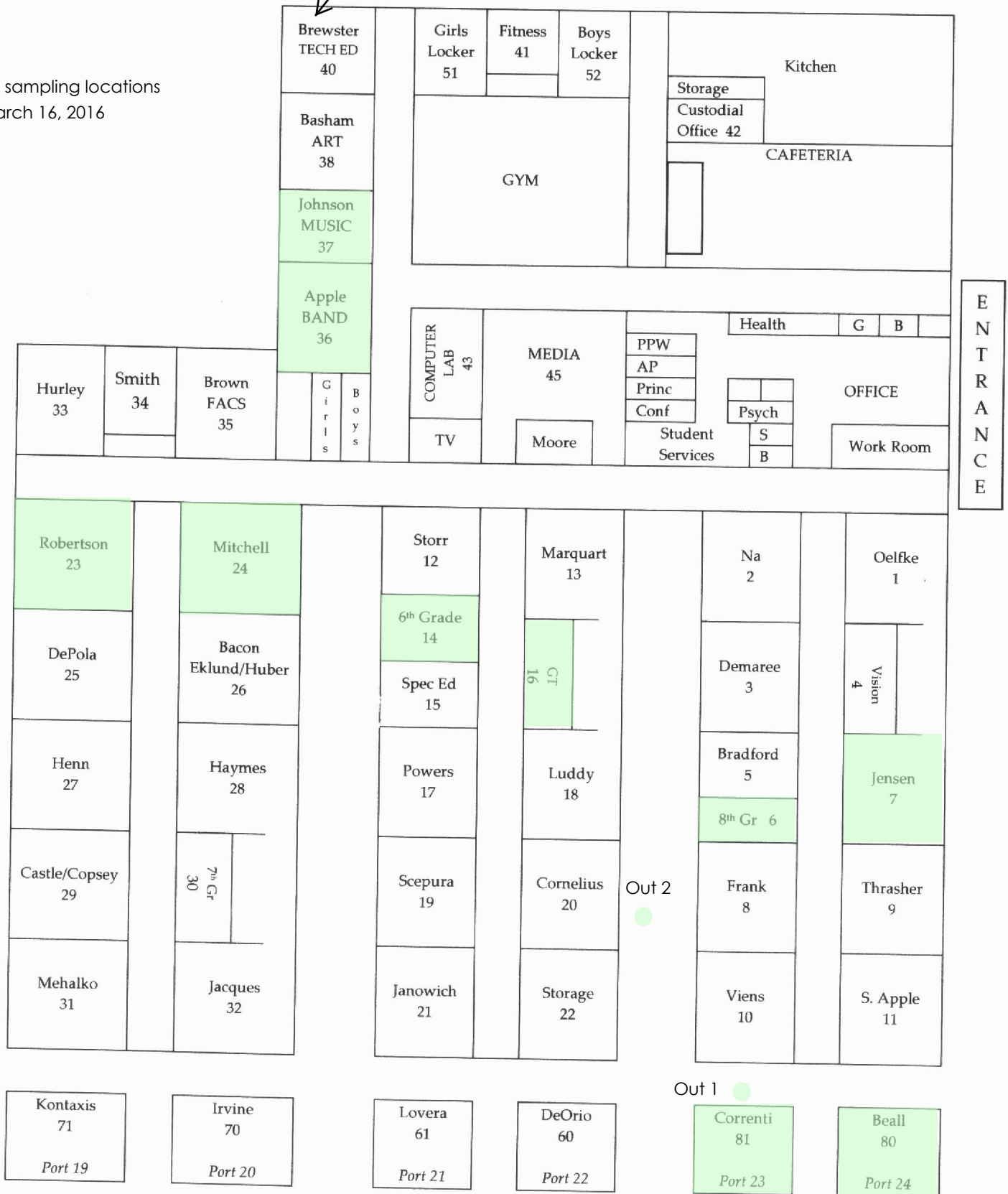
Glenwood Middle School Floor Plan

Spore sampling locations for March 16, 2016