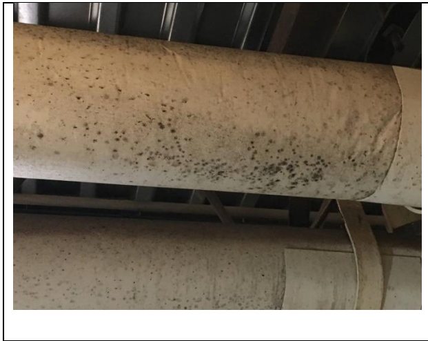
Photo 9: Suspected mold growth on pipe insulations in HVAC machine room