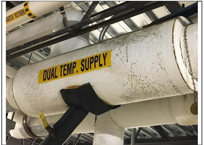
Photo 10: Suspected mold growth on pipe insulations in HVAC machine room