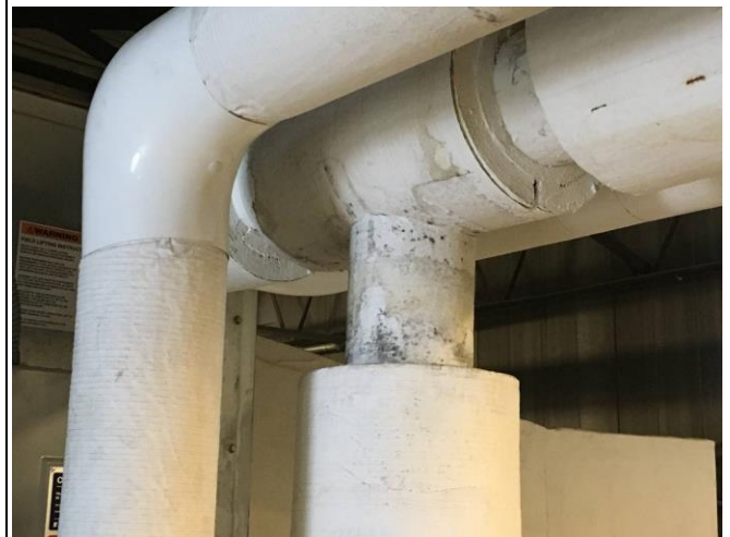
Photo 8: Suspected mold growth on Pipe insulations in HVAC machine room