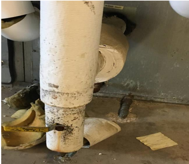
Photo 5: Suspected mold growth on Pipe insulations in HVAC machine room