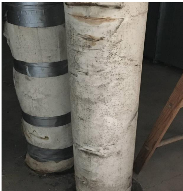
Photo 7: Suspected mold growth on Pipe insulations in HVAC machine room