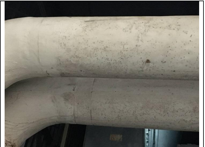
Photo 4: Suspected mold growth on Pipe insulations in HVAC machine room